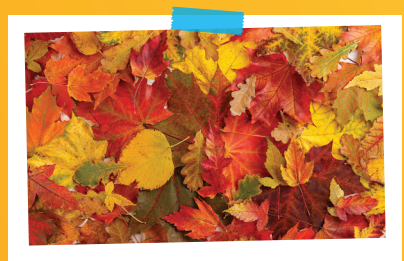
2 You can make your own gulal from ______ or flowers.