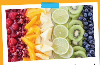
4 You can make coloured water with flowers, or vegetables.