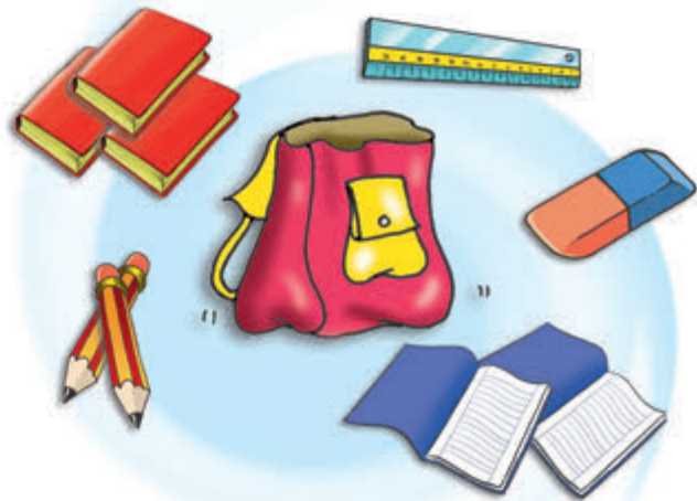
There are two pencils in Jack's schoolbag.